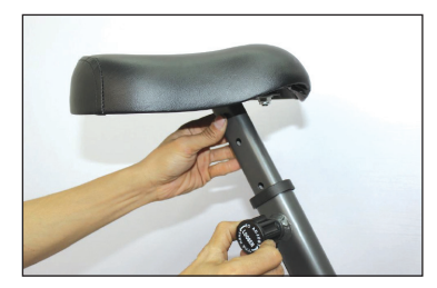
Secure knob back into place at desired height.