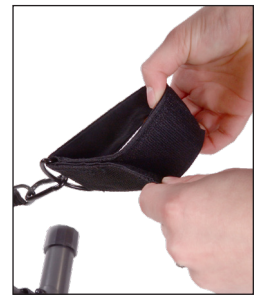
2. Open leg resistance strap by unlatching the hook and loop fastener.