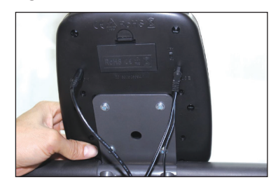
Wire connection completed.