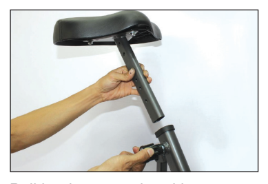
Pull knob outward and insert seat post into main frame.