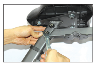
Place nut on screw and finger tighten. If difficult to tighten, nut may be upside down. Tighten fully with included wrench.