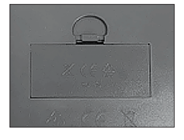
4. Replace the battery compartment door.