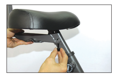
Insert screw through hole in backrest support.