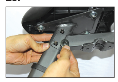
Place washer onto screw.