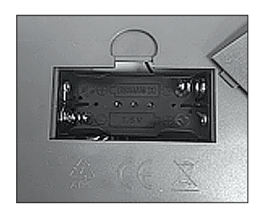
2. Note the diagram inside the compartment that shows the correct battery installation polarity.