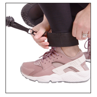
3. Wrap the strap around desired ankle and fasten hook and loop so that is secure but still comfortable.