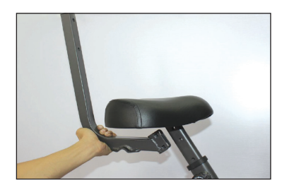
Align backrest support with hole in seat post.