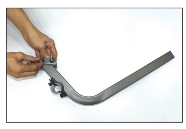
Remove screw, nut, and washer from the backrest support.