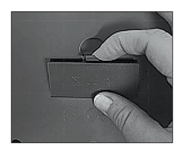
1. Open battery compartment door on the back of the bike control panel.

Requires 2 AA batteries (included). Do not mix old and new batteries. Do not mix alkaline, standard (carbon-zinc), or rechargeable (NiCd, Ni-Mh, etc) batteries.