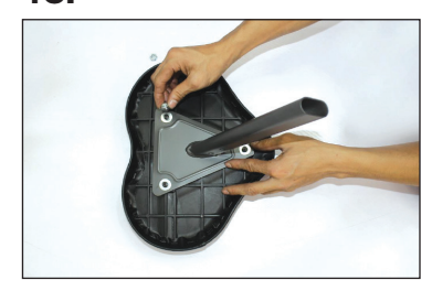
Finger tighten each nut onto the screws from seat cushion. If difficult to tighten, nut may be upside-down.