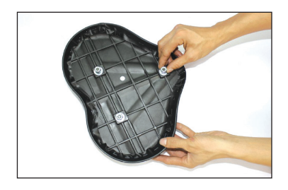
Take nuts and washers off of the seat cushion.