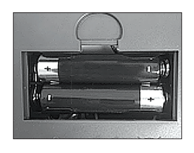
3. Install 2 AA batteries (included) according to the correct polarity.