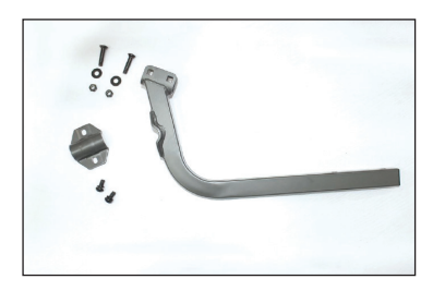
Place nuts and washer on the side for now.