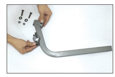
Remove screw, nut, and washer from fix plate on backrest support.