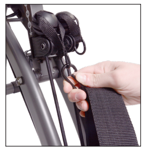
1. Hook leg resistance strap onto resistance band loop.